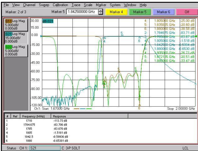
Duplexer DL path Transmission